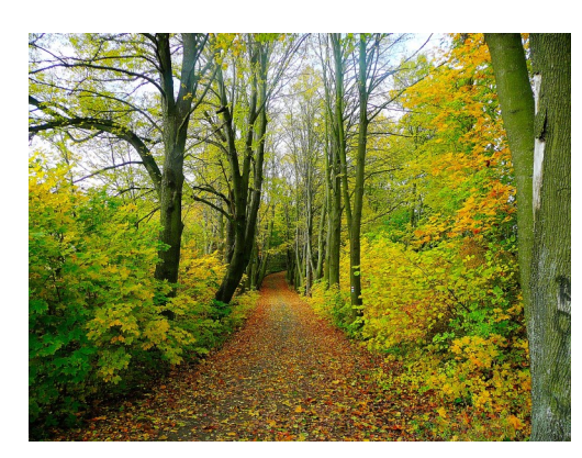
Navarino Nature Center will be closed for Gun Deer Season which runs from November 21st to the 29th.

Wreath Making Class: Sat., Dec. 5th, 9:00 to 11:30 am Learn how to create a wreath using natural materials from the wildlife area. Finished wreath will be on a 24" frame. $25 for members, $30 for non-members.